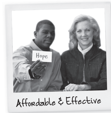
Affordable & Effective